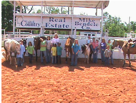
Chandler's FREE Beginning Speed Events Clinic