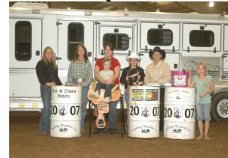
HPYF 3D Top 5 Winners

He Paid Your Fees Barrel Race and Ministry Retreat held October 19th-21st, 2007 At the Claremore Expo WAS AWESOME!!!!