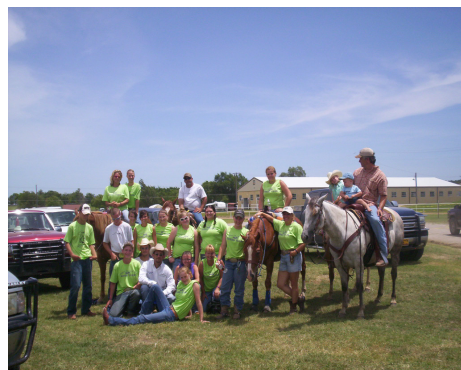
AMRT before Kiddo Day at Cavalcade